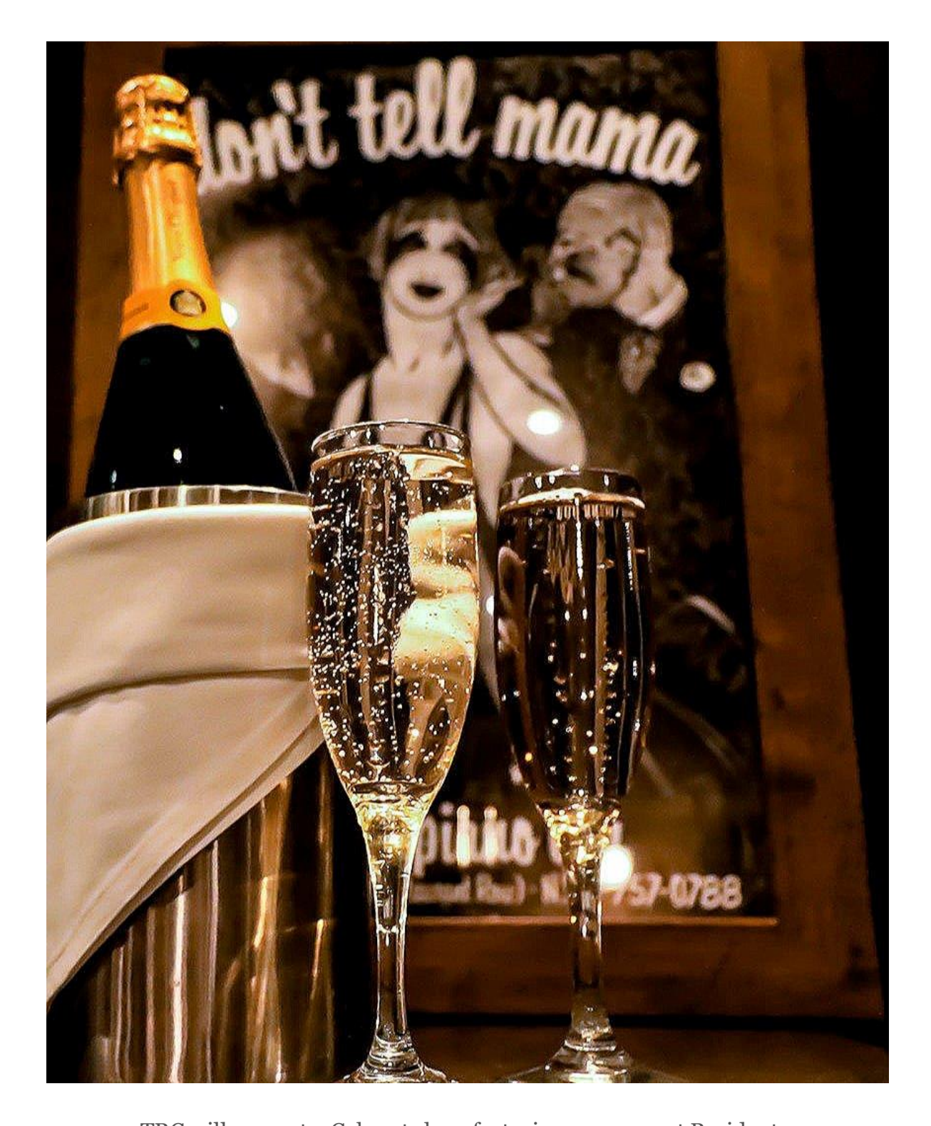
TRC will present a Cabaret show featuring our current Residents.